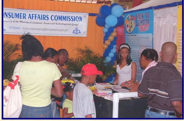
Back to School Trade Fair August 2006