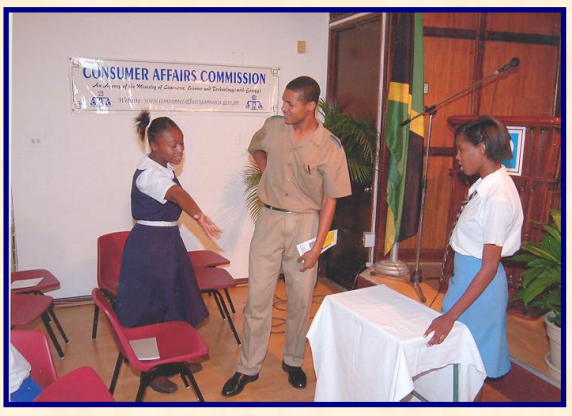
Students depict a consumer issue through role play at the Consumer Clubs in School workshop held in October 2006