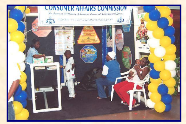
Children's Expo May 11 - 14, 2006